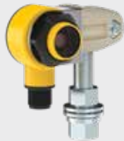
SMBAMS22P add -SS to model number for stainless steel models